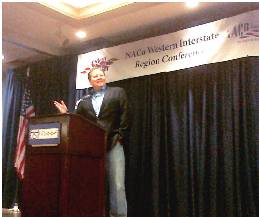
Brian Schweitzer, Governor of Montana welcomes WIR Attendees at the General Session